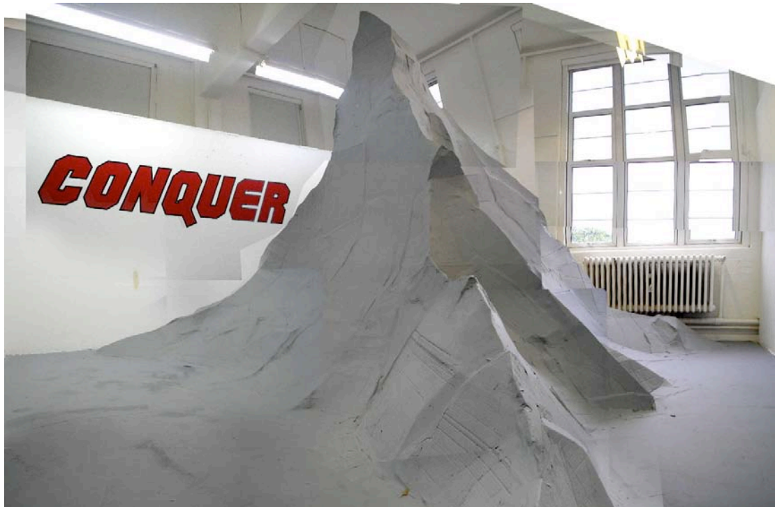
Tom Down Conquer, 2008