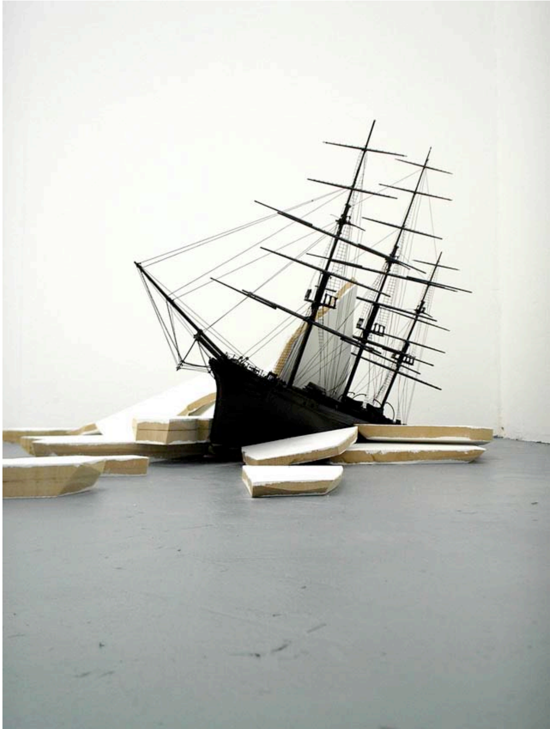
Tom Down This is the End, 2008